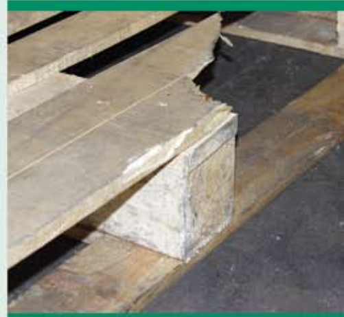
Bits of wood breaking off from the pallets caused drain blockages.