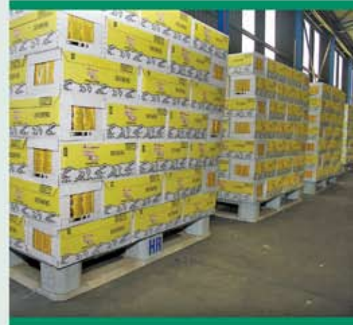
Kaymac Pallets are HACCP-compliant.